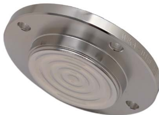
Diaphragm seal with sterile connection, model 990.60