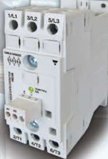
Three Pole Solid State Contactor