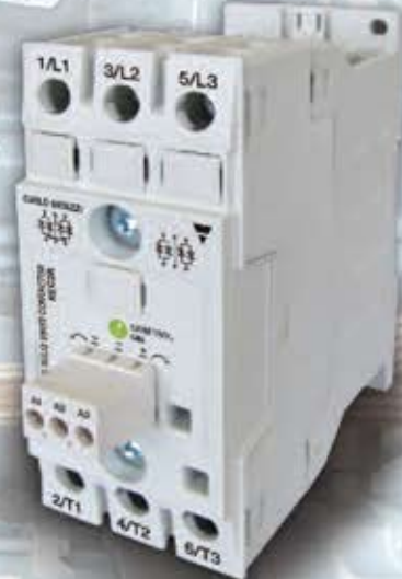
Reversing Solid State Contactor