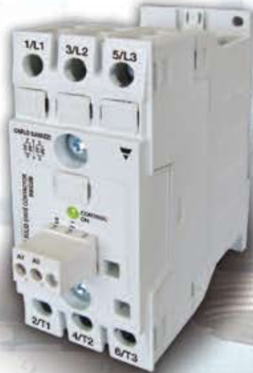
Two Pole Solid State Contactor

Three versions of solid state contactors are offered in a compact and stylish 44.5mm wide housing.