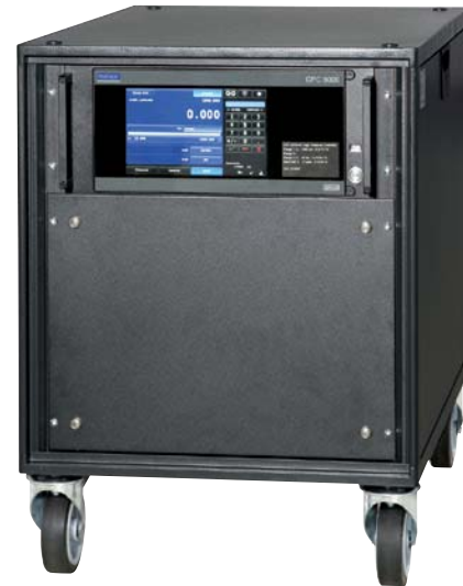
Precision high-pressure controller, model CPC8000-HC