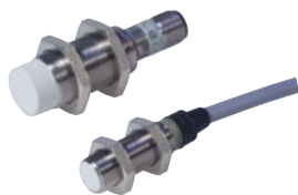
IA 12, 18, 30