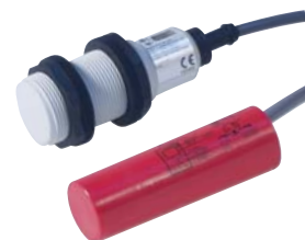
CA 12, 18, 30