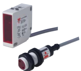
PA 18, PC 50