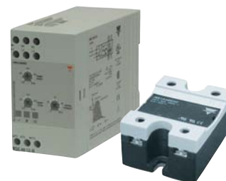
RSE / RM1A