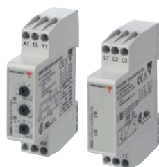
DIA, DIB, DIC