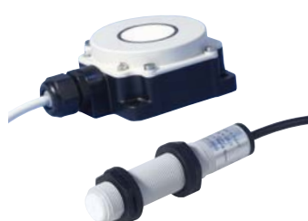
UA 18, 30, 80