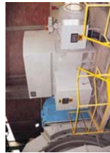
3620 kW, 6 pole, 6600 V, MAW630 frame motor Application: Mill