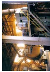
3150 kW, 12 pole, 6600 V, KA8000 frame motor Application: Exhaustor