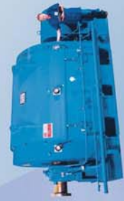
Turbogenerators Output ratings up to 60,000 KVA Voltages up to 13,000 V

Highly efficient to improve productivity