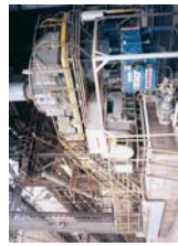
2 x 1100 kW, 6 pole, 6600 V, MA4500 frame motors Application: Vertical Mill