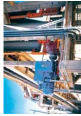
331 kW, 6 pole, 6600 V, MAF-400 frame motor Application: Conveyor Belt