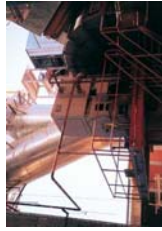
DC motors ranging from 15 to 1400 kW Application: Exhaustors