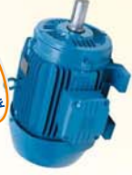
Industrial motors Output ratings from 2 to 400 HP