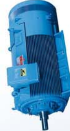
H line motors Output ratings from 100 to 3150 kW Voltages up to 11,000 V