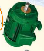
IEEE 841 motor Output ratings from 1 to 400 HP