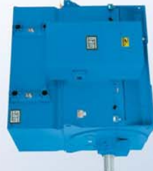
"Master" Line (steel laminated) squirrel cage or slip ring Outputs: up to 50,000 KW Voltages from 220 to 13,800V