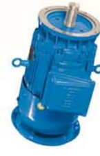
In-Line Extra Thrust motors Output ratings from 1 to 150 HP