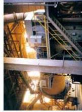
2 x 4200 kW, 6 pole, 6600 V, KA8000 frame motors Application: Mill