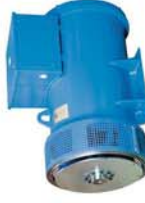
Synchronous Generators GTA Line Outputs: up to 4200 KVA