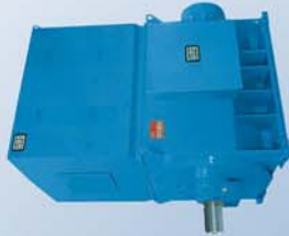
Synchronous Machines Output ratings up to 50,000 KW Voltages up to 13,800 V