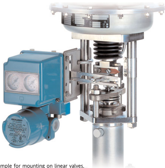
Example for mounting on linear valves, version with integrated gauges.