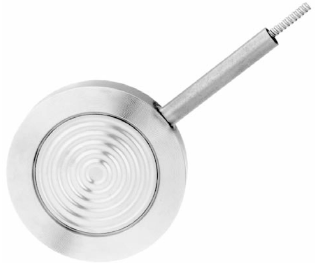
Diaphragm Seal, Flanged Process Connection, Cell-Type (Sandwich) Model 990.28 with Capillary