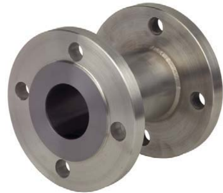
Diaphragm In-Line Seals for Flange Connections, Model 981.27

Pressure gauge or transmitter directly welded, process pressure transmitter with threaded adapter